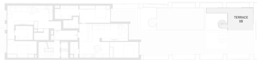
LEVEL 1 - TERRACE